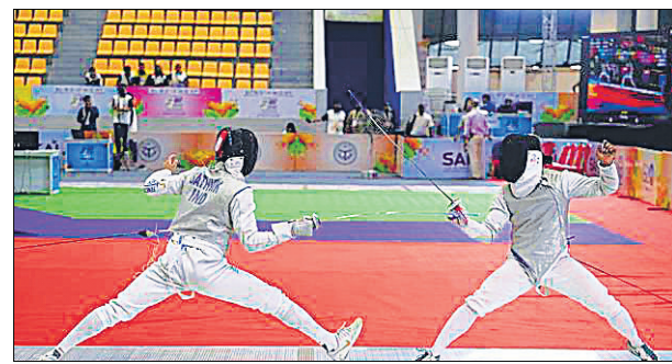
The pool round of the fencing contest was held at the Ekana Sports city in Lucknow on Wednesday

Three new Games records were created on the day, all in athletics, at Guru Gobind Singh Sports College tracks in Lucknow